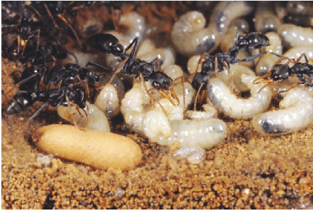
FIGURE 1: Myrmecia impaternalata , queen, workers, larvae, and a pupal cocoon in a laboratory observation nest (RWT, CDB).

queens which carry in their reproductive systems a lifetime sperm-bank acquired by mating as young flying adults; (ii) around 100-400 unmated apterous female workers, all daughters of the queen(s); (iii) eggs, larvae, and pupae (Figure 1) variously represented in correlation with an annual vernal season of oviposition by the queens, and (iv) in early summer numbers of winged males and/or winged virgin queens (= gynes): sons and daughters of the queen(s) held for later release to join an annual nuptial flight or mating promenade [1, 3]. The males disperse and die soon after mating and daughter colonies are founded by the newly mated gynes either singly or in small cooperating groups [1, 4].